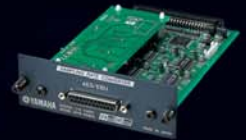
MY8-AE96S 8 channel AES/EBU format I/O (w/Sample rate converter)