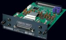
MY8-AD96 8 channel Analog Input Card