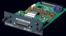
MY8-DA96 8 channel Analog Output Card