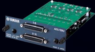
MY16-AE 16 channel AES/EBU format I/O