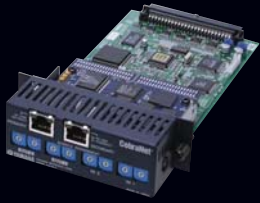
MY16-C CobraNet™ I/O