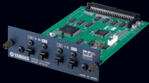
MY16-AT 16 channel ADAT format I/O

The MY16-C CobraNet™* expansion card allows transmission and reception of up to 32 channels (16 in/16 out) of uncompressed digital audio data. CobraNet™ is an audio networking system developed by Peak Audio (a division of Cirrus Logic, Inc.) that allows real-time transmission and reception of multiple channels of uncompressed digital audio signals via a Fast Ethernet (100 megabits/sec.) network.