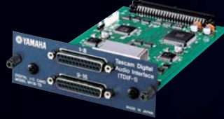
MY16-TD 16 channel TDIF format I/O