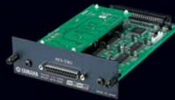
MY8-AE96 8 channel AES/EBU format I/O