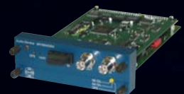
MY16MADI64-MADI64 Interface card MADI Digital I/O