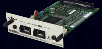
MY16-mLAN 16 channel m-LAN Interface Card