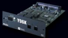
Y96K-Plug-in DSP Card Waves Effects and ADAT I/O

Developed, Manufactured & Supported by WAVES